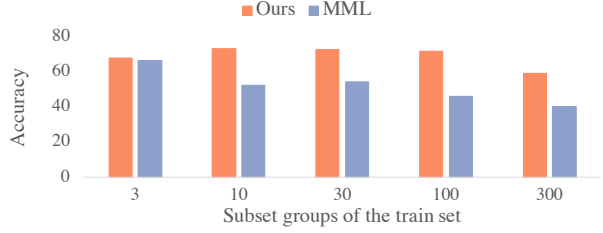
Figure 3: Varying the size of solution set ( |Z| ) at training. (Left) Subsets of the train set on WIKISQL varying in the size of solution set ( |Z| ). All subsets contain 10k training examples (total in the original train set is 55k). All subsets are evaluated on the same, original development set for a fair comparison. (Right) Performance across subsets of the training set with varying |Z| . Our method achieves substantial gains over MML.

Results. Table 4 shows that our training method significantly outperforms all the weakly-supervised learning algorithms, including 10% gain over the previous state of the art. These results indicate that precomputing a solution set and training a model through hard updates play a significant role to the performance. Given that our method does not require SQL executions at training time (unlike MAPO), it provides a simpler, more effective and time-efficient strategy. Comparing to previous models with full supervision, our results are still on par and outperform most of the published results.