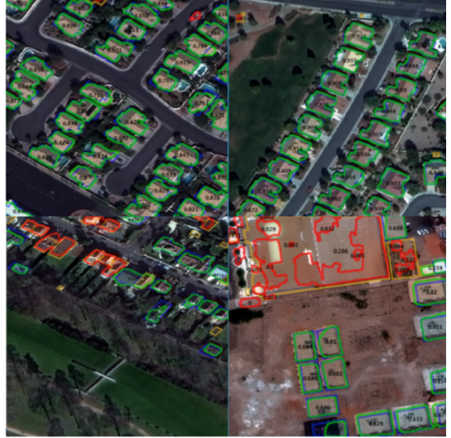
Figure 5: Results from SpaceNet baseline. From top left, clockwise: Vegas, Vegas, Khartoum, Paris. In all panels, the blue outline represents the ground truth, the green outlines are true positives, the red are false positives.

Compared to image-level classification problem, pixel-wise classification, or semantic segmentation, started to attract more research activities as a challenging task, for which deep learning pipelines are becoming the state of the art [60]. Volpi and Tuia [52] proposed to use an downsample-upsample CNN-based architecture and obtained an F1 score of 83.58% on Vaihingen and 87.97% on Potsdam. Audebert et al. [18] trained a variant of the SegNet architecture with multi-kernel convolutional layer, and achieved 89.8% on Vaihingen. Marmanis and colleagues [36] achieved similar performances using an ensemble of CNNs models trained to recognized classes and using edges information between classes. Authors in [22] performed a comparison of several state of art algorithms on