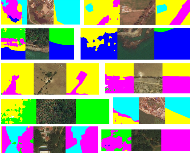
Figure 6: Some result patches (left) produced by our land cover classification baseline approach, paired with the corresponding satellite image (middle) and the ground truth (right).

row left and fourth row right) are also correctly classified by our model. Such cases, however, decreases the IoU score. Although the granularity of the segmentation looks superior to the ground truth (left of first two rows), applying a CRF or a clustering approach would improve the IoU scores.