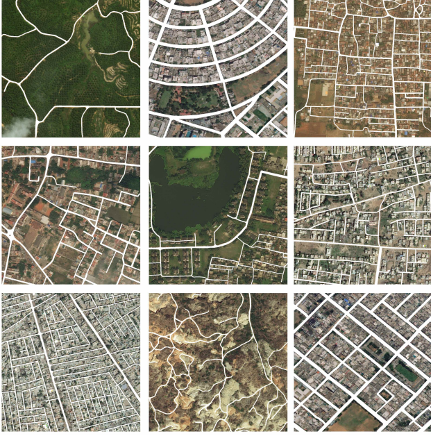
Figure 2: Road labels are annotated on top of the satellite image patches, all taken from DeepGlobe Road Extraction Challenge dataset.

important to note that the labels generated are pixel-based, where all pixels belonging to the road are labeled, instead of labeling only the centerline.