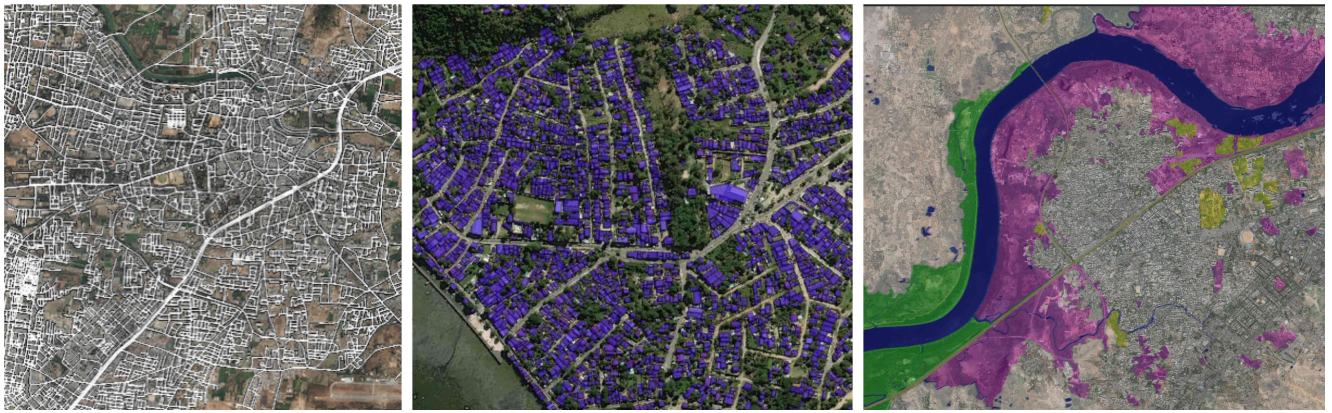
Figure 1: DeepGlobe Challenges: Example road extraction, building detection, and land cover classification training images superimposed on corresponding satellite images.

1 Facebook, 2 DigitalGlobe, 3 CosmiQ Works, 4 Wageningen University, 5 The MIT Media Lab