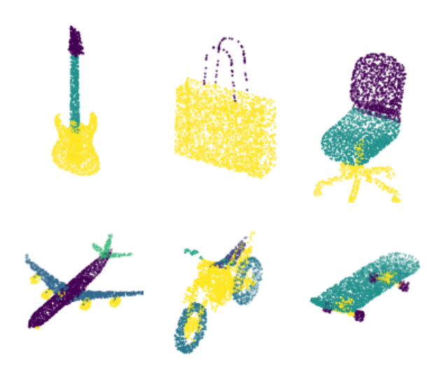
Figure 1: Examples of 3D point clouds of objects from the ShapeNet part-segmentation challenge [23]. The colors of the points represent the part labels.

The curse of dimensionality applies, in particular, to data that lives on grids that have three or more dimensions: the number of points on the grid grows exponentially with its dimensionality. In such scenarios, it becomes increasingly important to exploit data sparsity whenever possible in order to reduce the computational resources needed for data processing. Indeed, exploiting sparsity is paramount when