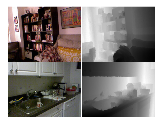
Figure 6: Two examples of RGB-D images from the NYU Depth dataset (v2) [16]. Each example comprises an RGB image (left) and a corresponding depth image (right).

tion using random affine transforms. We set S = 24 and use 64 filters in the input layer, three levels of downsampling, and two residual blocks per spatial resolution. The results of 10-view testing are compared with the competition entries in Table 1. With a test error of 85.98%, our network outperforms other methods by \geq 0.49\% IoU.