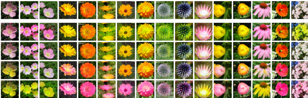
Figure 5: Examples of reconstructed flowers with different values of the pink attribute. First row images are the originals. Increasing the value of that attribute will turn flower colors into pink, while decreasing it in images with originally pink flowers will make them turn yellow or orange.

We performed additional experiments on the Oxford-102 dataset, which contains about 9,000 images of flowers classified into 102 categories [17]. Since the dataset does not contain other labels than the flower categories, we built a list of color attributes from the flower captions provided by [19]. Each flower is provided with 10 different captions. For a given color, we gave a flower the associated color attribute, if that color appears in at least 5 out of the 10 different captions. Although being naive, this approach was enough to create accurate labels. We resized images to 64 \times 64 . Figure 5 represents reconstructed flowers with different values of the “pink” attribute. We can observe that the color of the flower changes in the desired direction, while keeping the background cleanly unchanged.