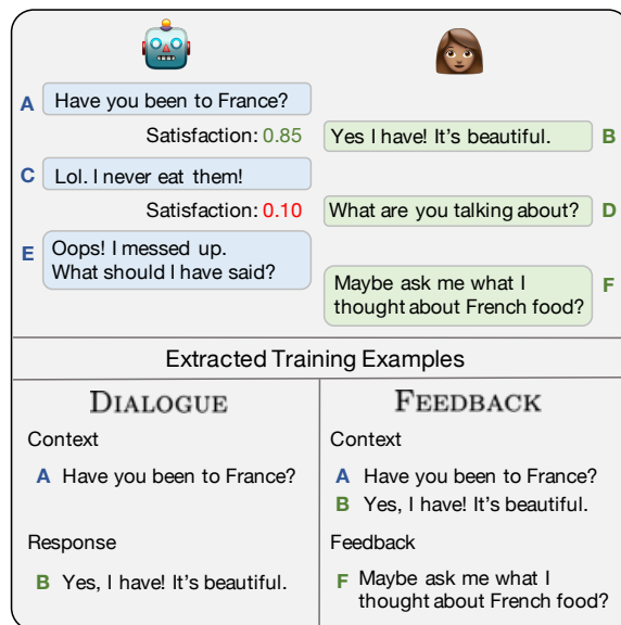
Figure 1: As the self-feeding chatbot engages in dialogue, it estimates user satisfaction to know when to ask for feedback. From the satisfied responses and feedback responses, new training examples are extracted for the DIALOGUE and FEEDBACK tasks, respectively, both of which improve the model’s dialogue abilities further.

Training a dialogue agent to converse like a human requires extensive supervision. The most common approach is to train models to imitate humans in large corpora of crowdsourced or scraped conversations (Serban et al., 2015). These fully-supervised conversations tend to be expensive to collect in sufficient quantity and/or occur in settings with significant differences from the deployment environment (Ross et al., 2009). Instead, dialogue agents would ideally learn directly from dialogue, the conversations they participate in after deployment, which are usually abundant, task-specific, dynamic, and cheap. This corresponds to the way humans learn to converse—not merely observing others engaging in “expert-level” conver-