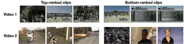
Figure 3: Top-ranked and bottom-ranked clips by SCSampler for two test videos from Sports1M. Top-ranked clips often show the sports in action, while bottom-ranked clips tend to be TV-interviews or static segments with scoreboard. Clips are shown as thumbnails. To see the videos please visit http://scsampler.ai .

While our SCSampler has low computational cost, it adds the procedural overhead of having to train a specialized clip selector for each classifier and each dataset. Here we evaluate the possibility of reusing a sampler s(\cdot) that was optimized for a classifier f on a dataset \mathcal{D} , for a new classifier f' on a dataset \mathcal{D}' that contains action classes different from those seen in \mathcal{D} . In Table 3, we present cross-dataset performance of an SCSampler trained on Kinetics but then used to select clips on Sports1M (and vice-versa). We also report cross-classifier performance obtained by optimizing SCSampler with pseudo-ground truth labels (see section 3.2.2) generated by R(2+1)D-18 but then used for video-level prediction with action classifier MC3-18. On the Kinetics validation set, using an SCSampler that was trained using the same action classifier (MC3) but a different dataset (Sports1M) causes a drop of about 2% (65.0% vs 67.0%) while training using a different action classifier (R(2+1)D) to generate pseudo-ground truth labels on the the same dataset (Kinetics) causes a degradation of 1.1% (65.9% vs 67.0%). The evaluation on Sports1M shows